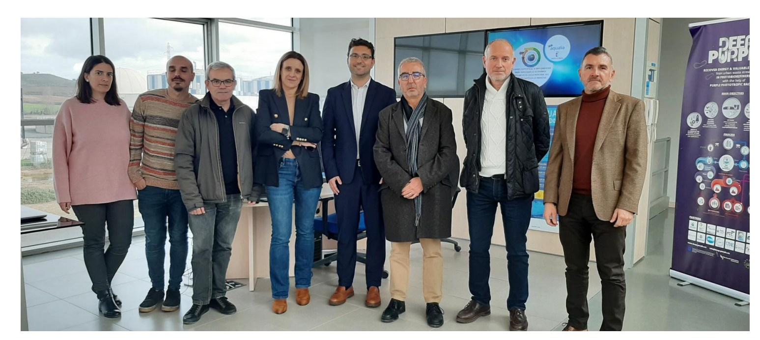
Castile-La Mancha and Aqualia are committed to improving the circular economy

The regional ministry of Castile-La Mancha and Aqualia are developing a project to provide solutions and promote new specific circular economy actions across the entire water cycle.