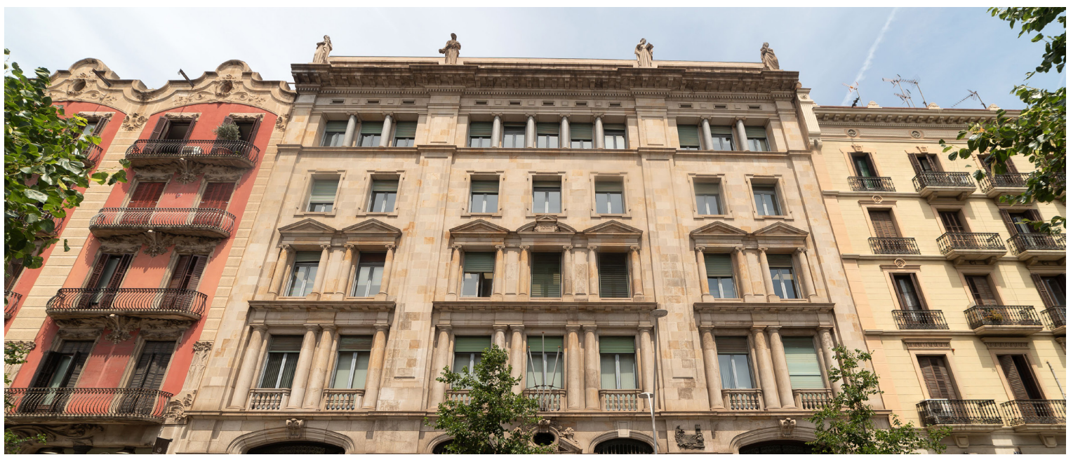
The FCC Corporate Headquarters in Barcelona is celebrating its 100th anniversary

1923 marked the beginning of the construction of the FCC headquarters at number 36, calle Balmes. This historic building is part of the Architectural Heritage of Barcelona.