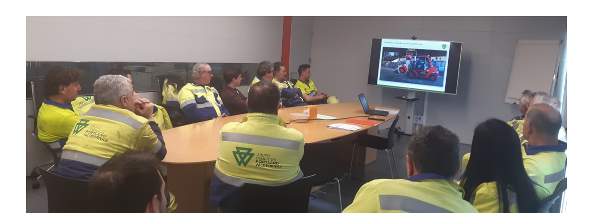
Safety as a value in the Cementos Portland Valderrivas Group

FCC Medio Ambiente is given a five-star rating in the British Safety Council's Occupational Health and Safety Audit